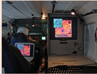
Complete mission equipment financing available