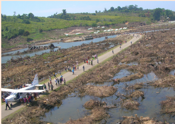
Special Mission - Tsunami Relief

Lease Purchase Financing is an Expense Item rather than a Capital Item. There is No Need for a Vote for Authority Approval nor is there the cost of a Bond Underwriting