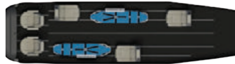
Dual Medical Station